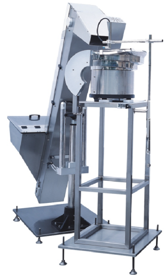
Option: Vibratory Cap Unscrambler